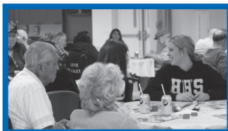
HHS Student Council

delivered over a $1000 dollars in supplies that were raised by HHS students, and then they spent the afternoon with the residents, playing