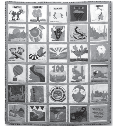
Centennial Quilt from Cortina School

“Kindergarten Round-up on March 1st is a great opportunity for you and your kindergartner to visit the campus, meet teachers and classmates, and hear about the kindergarten learning standards.”