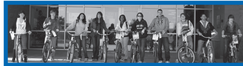
Lucky Students with Bicycles

Williams Field High School was privileged to award ten lucky students with bicycles. Students were picked at random and winners were announced on Tuesday December 28, 2011. Congratulations to our winners and thank you to the partnerships that provided the holiday surprise. 🎁