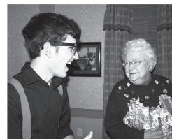
Student Council “Senior Social”