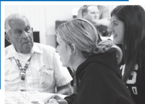
HHS Student Council

In December, Higley High’s Student Council visited the State Veterans Nursing Home. The students