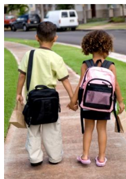
Students Walking To and From School

If the student returns the same day, parents must sign the student back in. The student will receive an admission slip before returning to class.